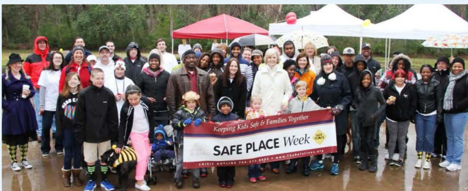
The Relatives, Inc. in Charlotte, North Carolina held a "Celebration & Stroll" event during NSP Week. Participants enjoyed games, music, food, free give-aways, and a stroll through town in support of the agency and Safe Place.