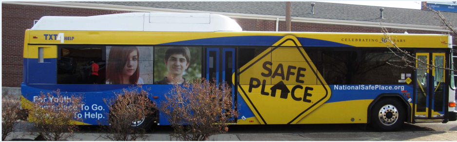
TARC bus in Louisville, Ky. displays an advertisement to celebrate the 30th Anniversary of Safe Place.