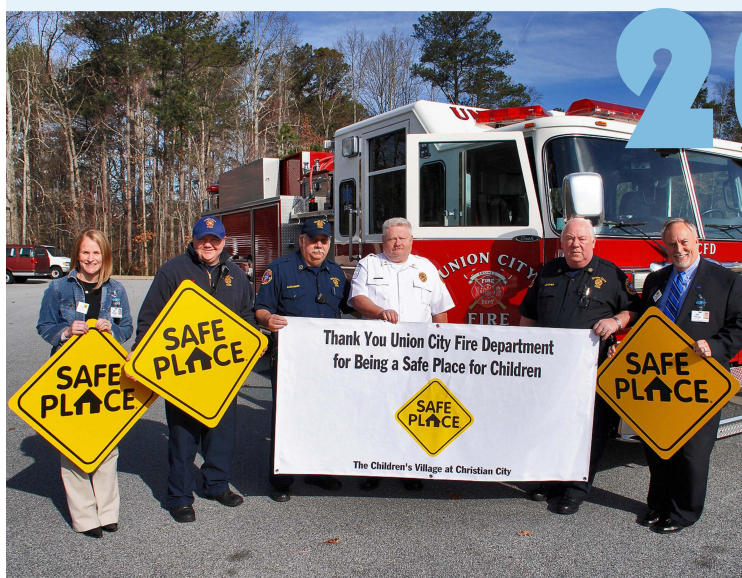
The Union City Fire Department in Union City, Ga. along with staff from The Children's Village at Christian City.

National Safe Place (NSP) Week was celebrated nationwide on March 17-23, 2013. The annual week highlights the Safe Place program, which has helped more than 285,000 youth in crisis since it was founded in 1983. This year, NSP partnered with the Transit Authority of River City (TARC) in Louisville to wrap a public bus in a Safe Place advertisement. The bus wrap, which displays a very large Safe Place logo, was unveiled during NSP Week and will be displayed in Louisville for one year. NSP also launched a brand new mobile website and a Safe Place video contest for youth.