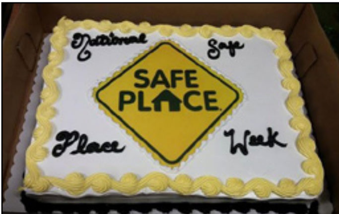
Staff at Haven House in Raleigh, North Carolina celebrated NSP Week with cake.