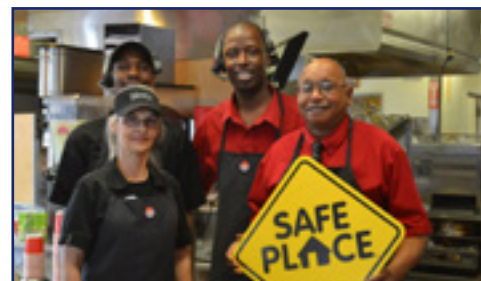
Clark County Youth & Family Services in Jeffersonville, Indiana thanked the employees at Wendy's for participating as a Safe Place site.