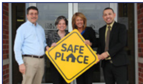
Crisis Center, Inc. in Northwest Indiana launched a Safe Place site partnership with TradeWinds Services, a nonprofit organization serving individuals with special needs.