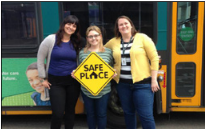
Safe Place Coordinators from YouthCare, Friends of Youth and Auburn Youth Resources thank King County Metro for participating as Safe Place partner in Seattle, Washington.