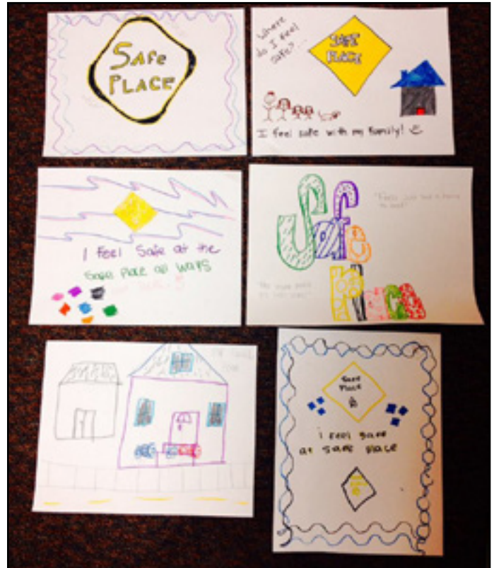
Youth at YMCA Safe Place Services in Louisville, Kentucky created artwork to celebrate NSP Week.