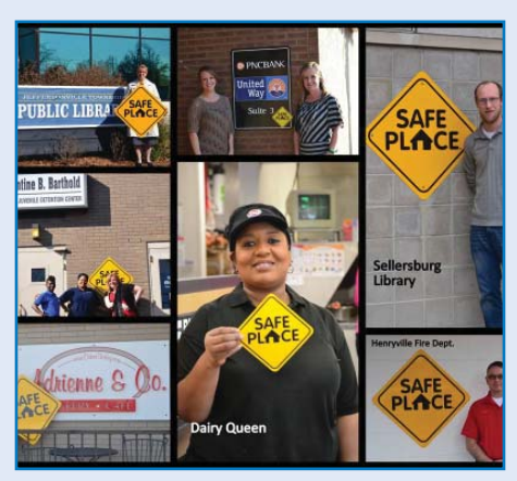
Jeffersonville, Indiana - Clark County Youth Services thanked their Safe Place sites for supporting youth