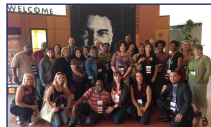
Participants gather for a photo during a site visit to the Muhammad Ali Center in Louisville, Kentucky.

On October 1-3, more than one hundred youth service professionals gathered in Louisville for National Safe Place Network's (NSPN) Focus 2014 Conference – "Walk a Mile in My Shoes," at The Brown Hotel. Attendees had the opportunity to network and discuss ideas of significance related to strengthening youth and family services.