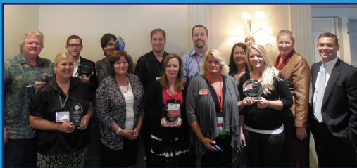
Award recipients pose for a photo after the 2014 NSPN Awards ceremony held during the Focus 2014 Conference.

Year in and year out, youth service professionals, volunteers and community organizations work diligently to strengthen youth and families. NSPN recognized individuals, organizations and companies who have and continue to make a difference in the lives of youth.