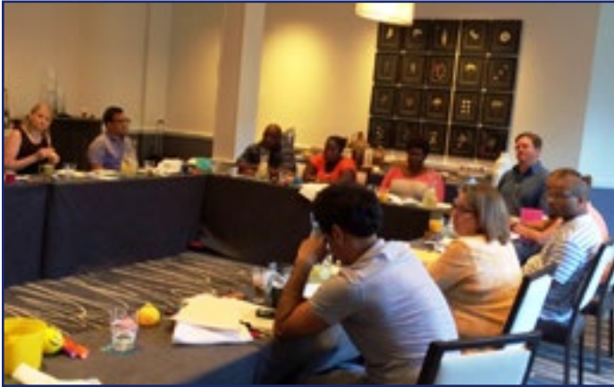
Attendees participate in NSPN's New Leadership Institute in Savannah, Georgia.

The 2015-2016 membership year has been one of growth for NSPN. As of early September, NSPN membership has expanded into 31 states , up from 22 states in 2014-2015. Members have access to several webinars conducted this year on the topics of fundraising, advocacy, marketing, leadership, and more. In addition, NSPN hosted a number a new training events. These include: