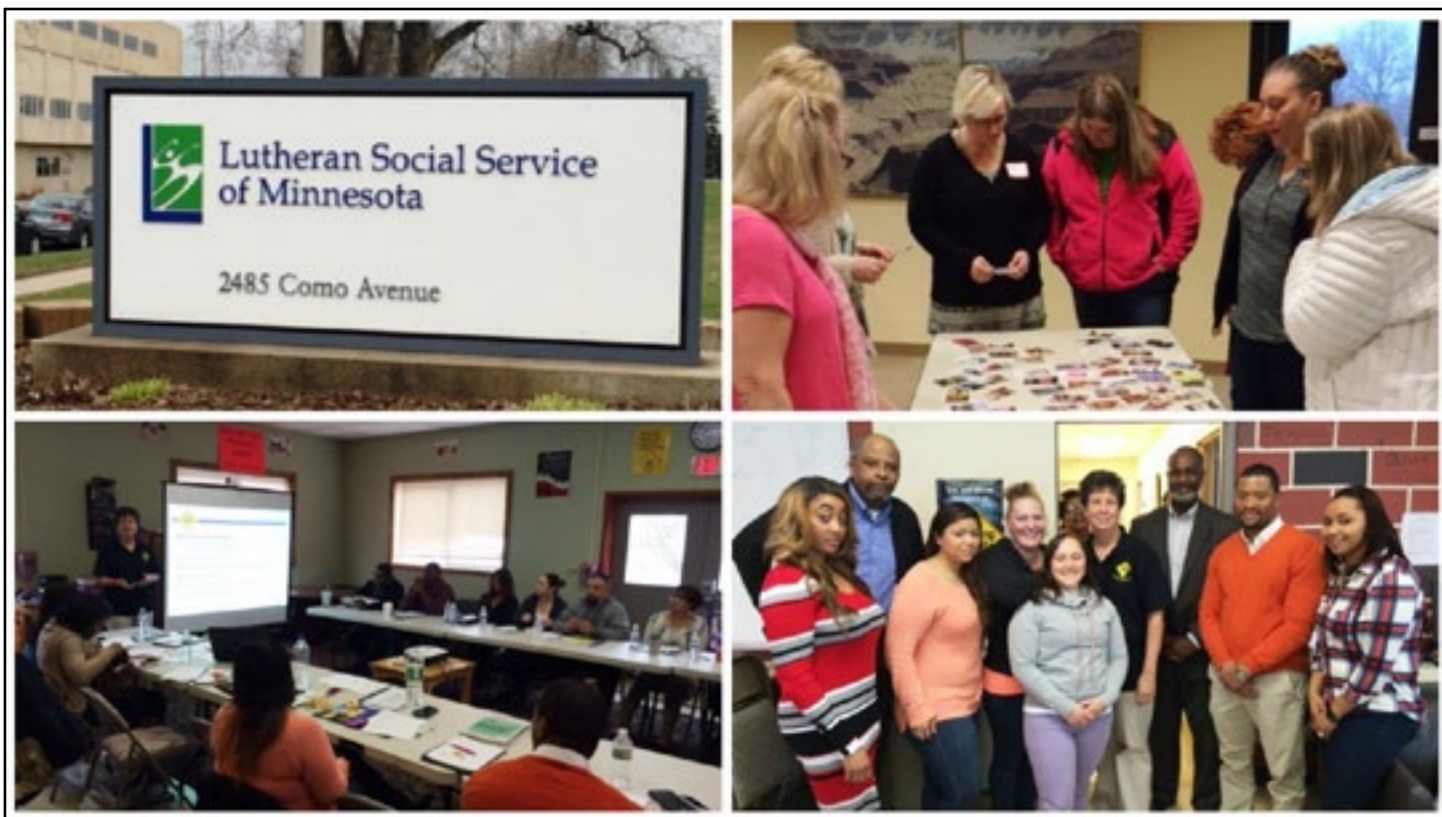
Photos taken during Safe Place Implementation trainings hosted at Lutheran Social Service of Minnesota in Minneapolis and Somerset Homes in Bridgewater, New Jersey.

Interested in starting Safe Place in your community? Contact us today to learn more about how you can expand the national safety net for youth! info@nationalsafeplace.org