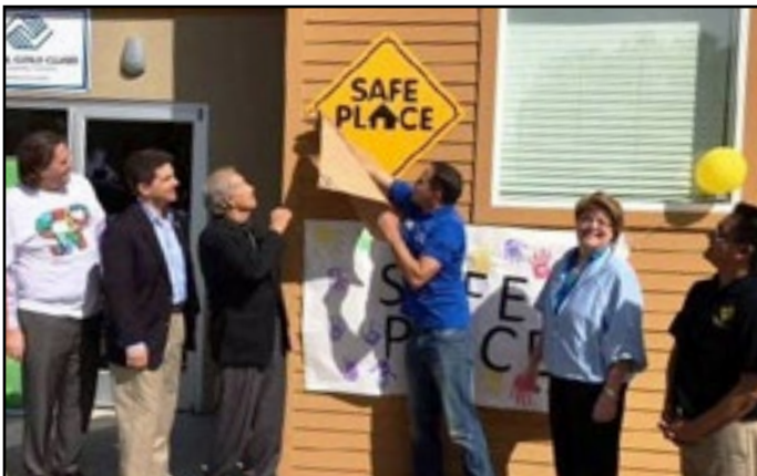
Fresno EOC Sanctuary and Youth Services launched a Safe Place site partnership with the Mendota Boys & Girls Club.