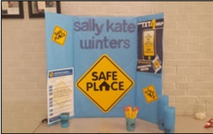
During NSP Week, Sally Kate Winters set up Safe Place information tables in middle and high schools in West Point, Mississippi.