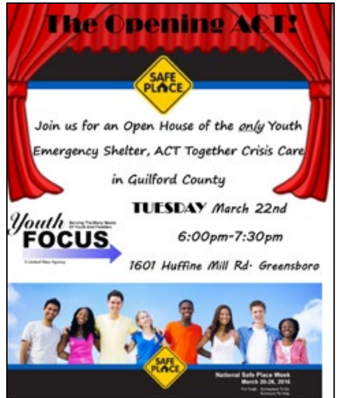
Youth Focus in Greensboro, North Carolina hosted an open house to showcase their emergency shelter program, Act Together Crisis Care.