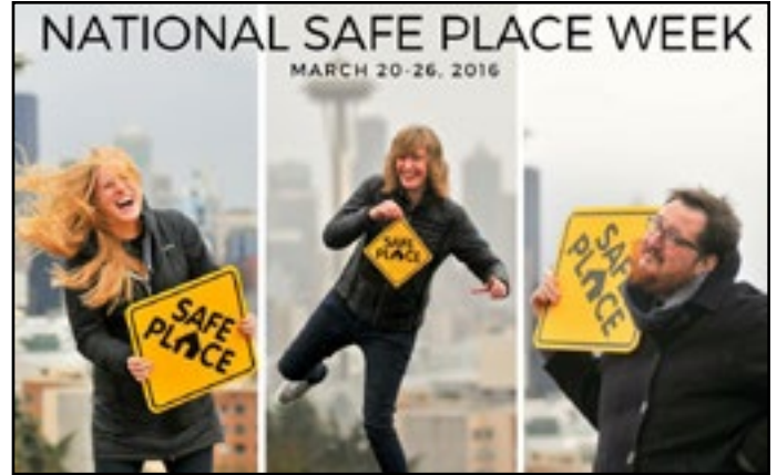
The King County, Washington Safe Place team had fun posing with the sign to promote NSP Week.