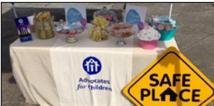
Advocates for Children in Cartersville, Georgia hosted a bake sale to support their Safe Place program.